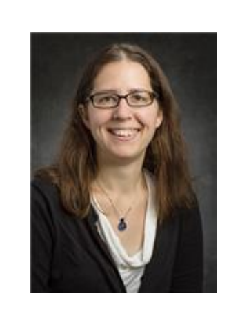
Nuclear Physics Experiment