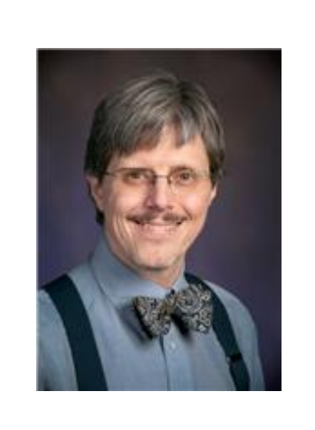
AMO & Quantum Information Science