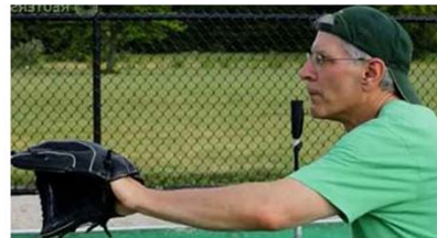
The ball is caught by the catcher.

The active voice uses direct, action verbs, and the subject of the sentence does the action.