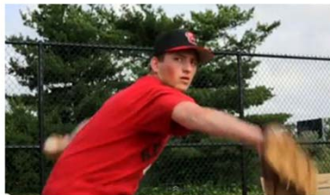
The pitcher throws the ball.

Passive voice: the subject of the sentence receives the action of the verb—the subject is acted upon