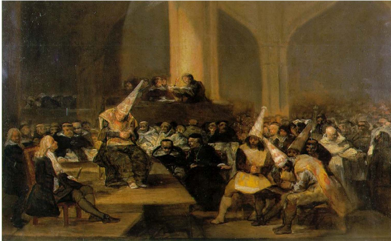
Inquisition Scene, by Francisco Goya, 1816