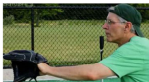
The ball is caught by the catcher.

Editorial advice from the ACS: “Use the passive voice when the doer of the action is unknown or not important.”