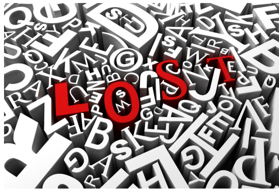
Lost in Jargon