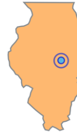
Guidance for Physics Students (GPS)