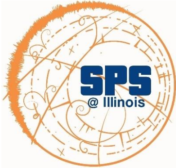
Society of Physics Students (SPS)