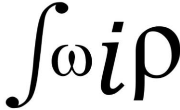
Society for Women in Physics (SWIP)