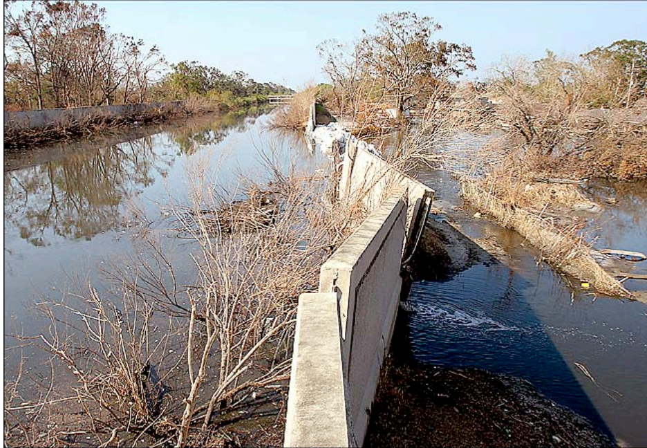
Levees in New Orleans, broken at their thermal expansion joints. They didn't break from heat, but from the pressure of the flood.