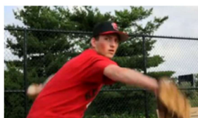
The pitcher throws the ball.

Passive voice: the subject of the sentence receives the action of the verb—the subject is acted upon