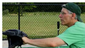
The ball is caught by the catcher.

Editorial advice from the ACS: “Use the passive voice when the doer of the action is unknown or not important.”