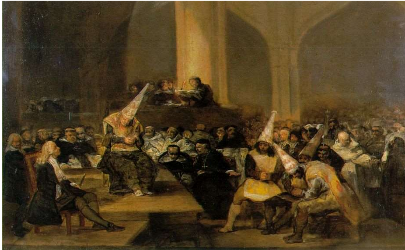
Inquisition Scene, by Francisco Goya, 1816