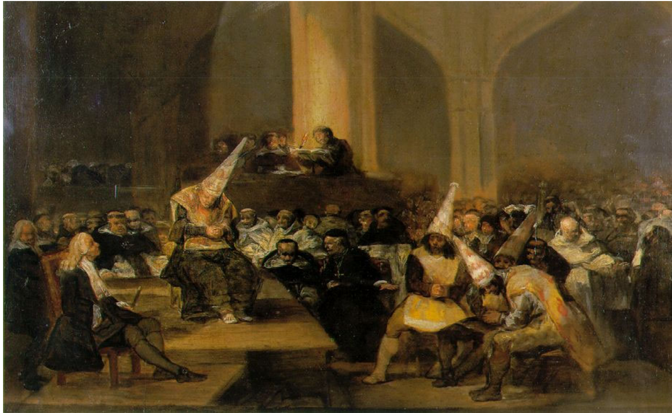
Inquisition Scene, by Francisco Goya, 1816